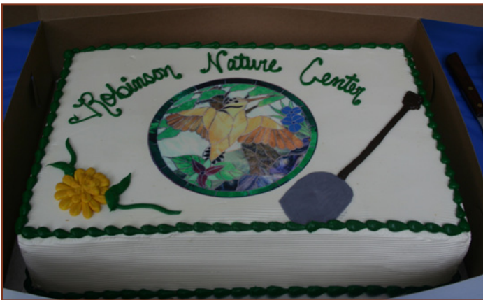
Congratulatory cake, sponsored by the Robinson Foundation and served at the groundbreaking of the Robinson Nature Center, August 29, 2009.